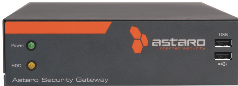
Astaro Security Gateway 110/120