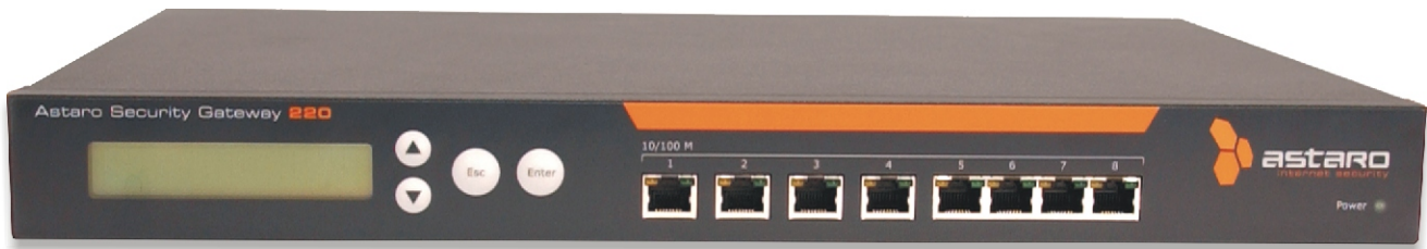
Astaro Security Gateway 220